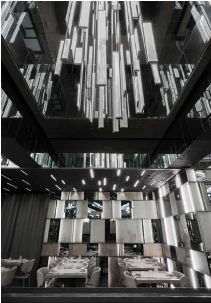
Ground Floor – view of the central light installation, an almost full-height sculpture made with backlit extra light glass blades at Sushi Club, Cesano Maderno (Italy). Project Maurizio Lai Architects.